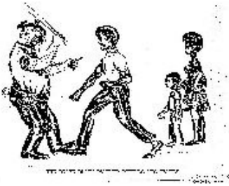
Click for full size picture. (12K)